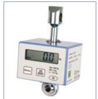
Digital weigh scale

One of the restrictions of using certain lifts is the type of slings you can use on the product. The Presence however gives you a choice of sling systems because you can use either the conventional 6-point Oxford spreader bar (A) or a 4-point positioning cradle (B - powered version shown). This choice provides the carer with a greater option of slings to use when considering support, comfort and flexibility for the patient. The 4-point cradle is also available in both manual and powered versions.