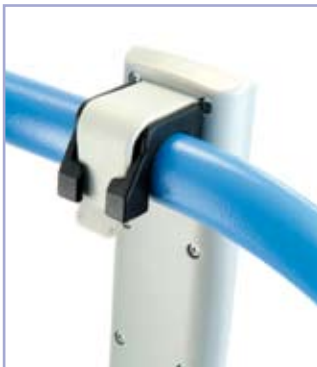
Convenient hand control rest