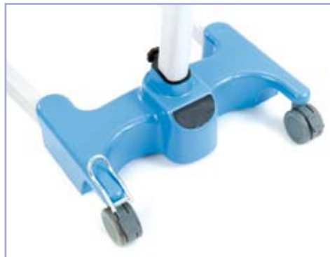
Ergonomic foot push pad