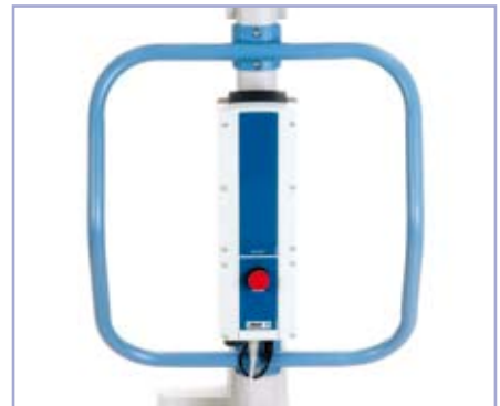
Ergonomic oversized push handle